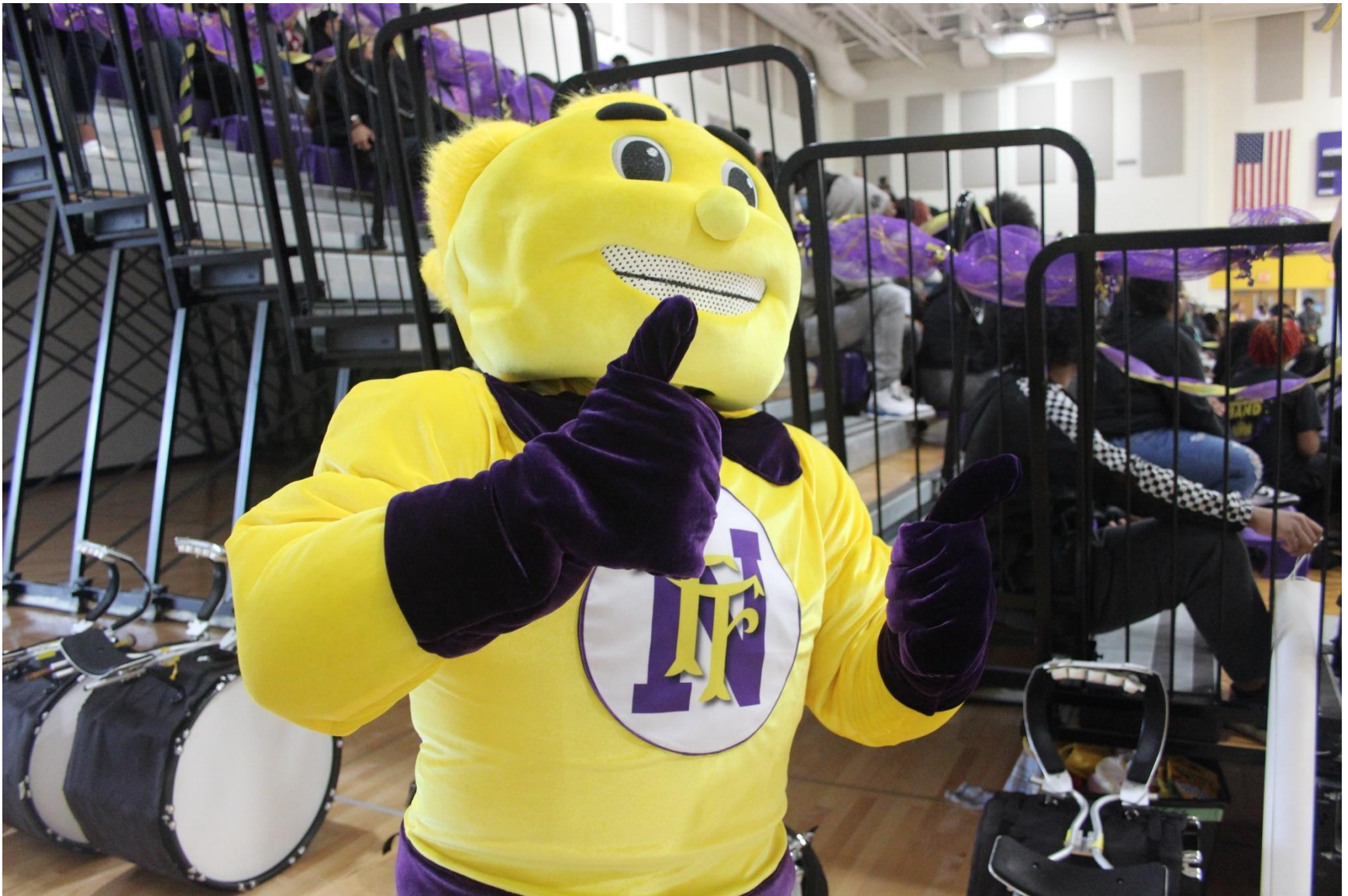
After going missing for more than a decade, Meteor Man returned to T.F. North.