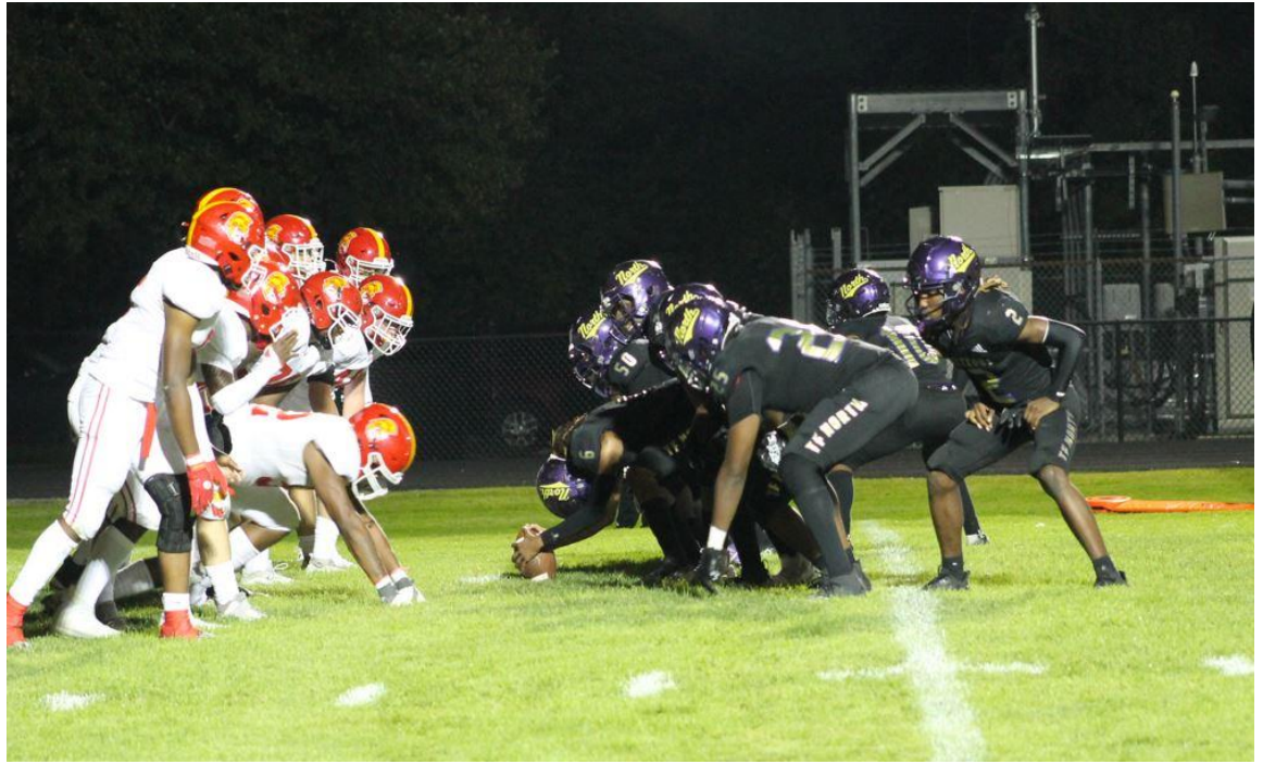
The Meteors line up for the extra point against the Titans of Tinley Park.