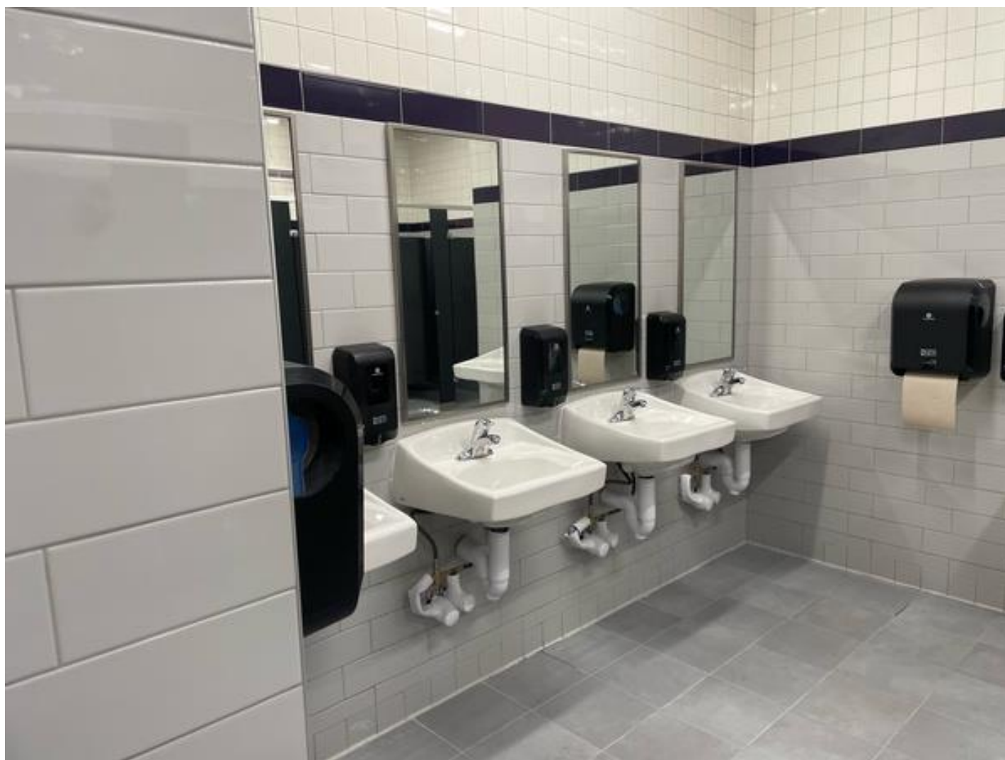
Built during the Great Depression, the bathrooms in the 100 and 200 levels were remodeled during the summer and now look modern.